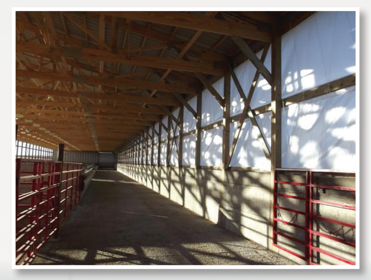
Optional curtain for north side exposure