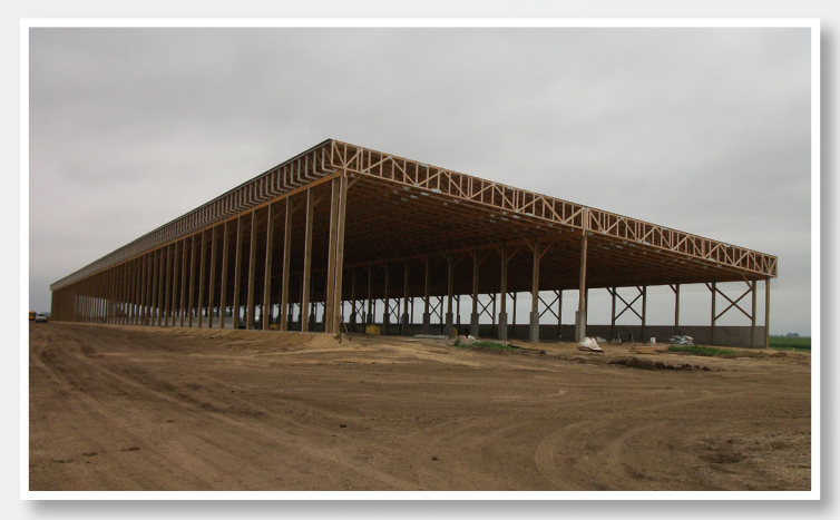
Open web trusses