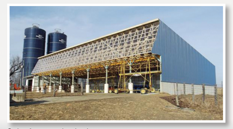
Solar front cattle shed

Hay and commodity barns Cattle sorting and handling No job too big or too small